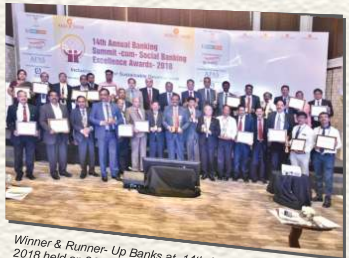
Winner & Runner- Up Banks at 14th Annual Banking Summit 2018 held on 26th February 2019, Mumbai.