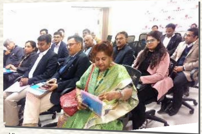
View of the audience during Round Table Discussion Meeting