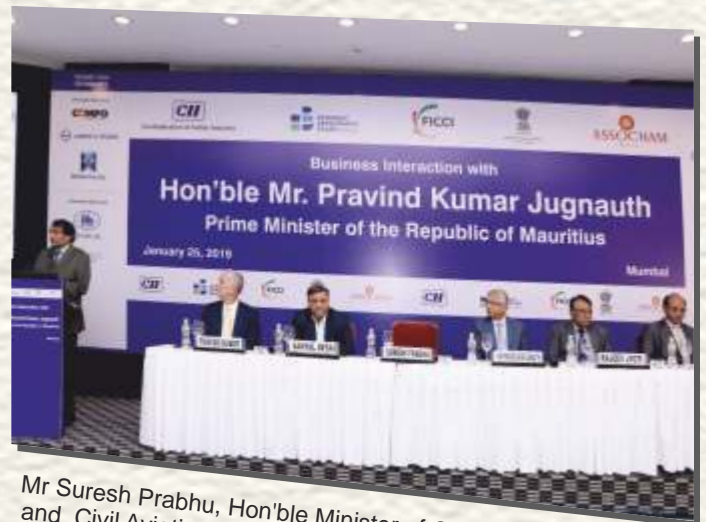
Mr Suresh Prabhu, Hon'ble Minister of Commerce and Industry, and Civil Aviation, Govt. of India addressing the India-Mauritius Business Forum on 25th January 2019 at Mumbai