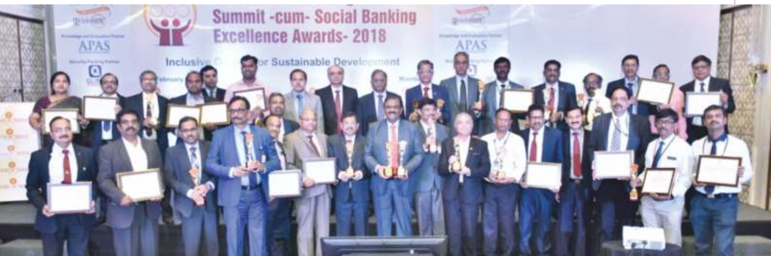
Winner & Runner-Up Banks at 14th Annual Banking Summit 2018 held on 26th February 2019, Mumbai.

The report also showcased the performance of various government schemes such as Pradhan Mantri Jan Dhan Yojana (PMJDY), insurance schemes like Pradhan Mantri Jeevan Jyoti Bima Yojana (PMJJBY) and Suraksha Bima Yojana (PMSBY), Atal Pension Yojana (APY) and many others and how they are bringing in difference in the lives of people across rural India.