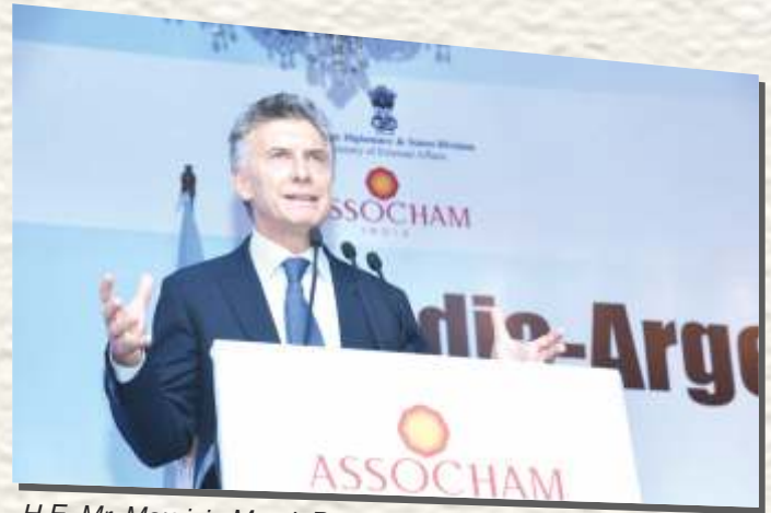
H.E. Mr. Mauricio Macri, President of the Republic of Argentina addressing the audience at the India-Argentina Business Forum on Monday, 18th February, 2019 in New Delhi.