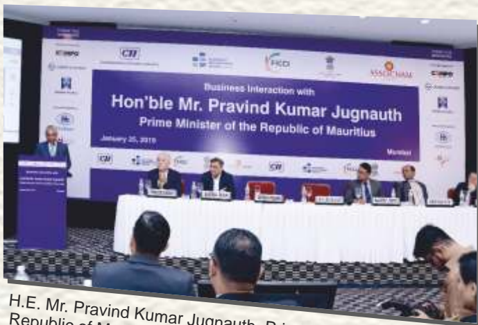
H.E. Mr. Pravind Kumar Jugnauth, Prime Minister of the Republic of Mauritius addressing the India-Mauritius Business Forum on 25th January 2019 at Mumbai