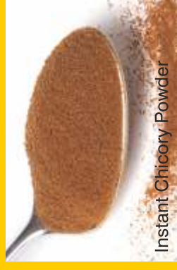
Instant Chicory Powder

11 th Floor, Welldone Tech Park Sector - 48, Sohna Road, Gurgaon -122 001 (Haryana) India Tel.: 0091-124-4968600 Fax : 0091-124-4968608