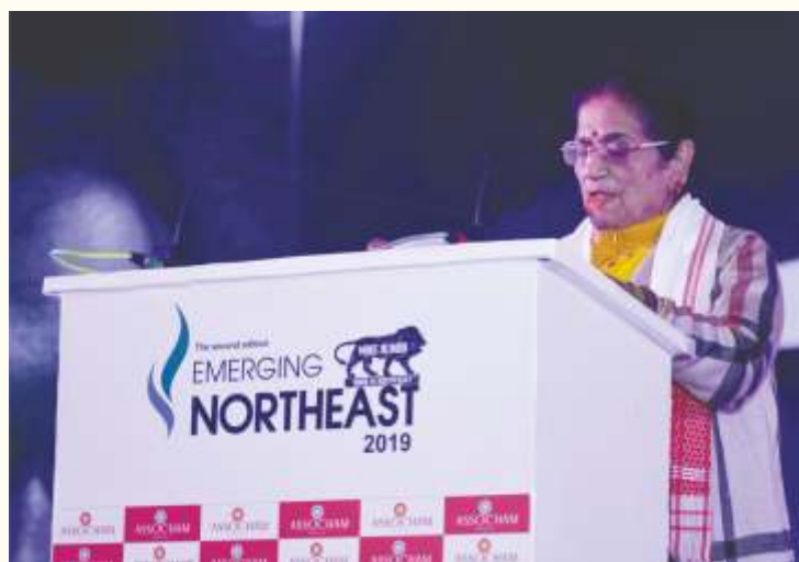
Smt Bijoya Chakravarty, Hon'ble Member of Parliament – Lok Sabha giving inaugural address in 2nd Edition of Emerging North East 2019 held from 20-22 Feb, 2019 in Guwahati, Assam

Emerging North East 2019 aims to highlight and showcase the potential of this region in sectors like agriculture, horticulture, food processing, livestock, rural development, infrastructure, energy, social and development sectors. With developing commercial links, NorthEast India can become a prosperous doorway to India's future and get on to the world stage by taking up opportunities offered.