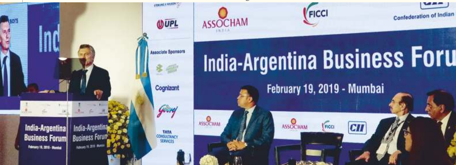
H.E. Mr. Mauricio Macri, President of the Republic of Argentina addressing the audience at the India-Argentina Business Forum on Tuesday, 19th February, 2019 in Mumbai