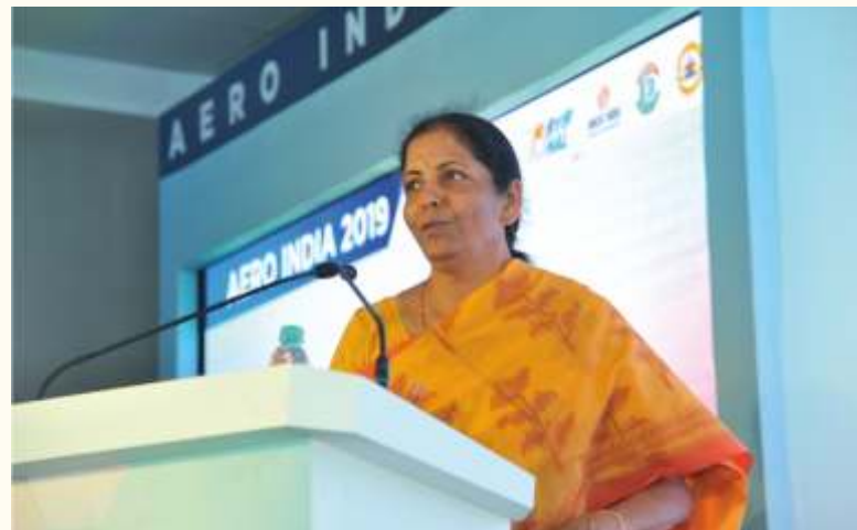
Smt. Nirmala Sitharaman, Hon'ble Union Minister for Defence, Government of India addressing the conference

Reiterating the requirements of the Indian aviation sector, Ms Sitharaman said that she has advised the ministry to form three groups to work on areas that need immediate intervention. She said, "Firstly, India needs at least 1600 aircrafts of various sizes in next 10 years and hence needs a relevant ecosystem for maintenance and repair