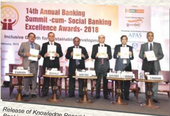
Release of Knowledge Report by Chief Guest at 14th Annual Banking Summit 2018 held on 26th February 2019, Mumbai.