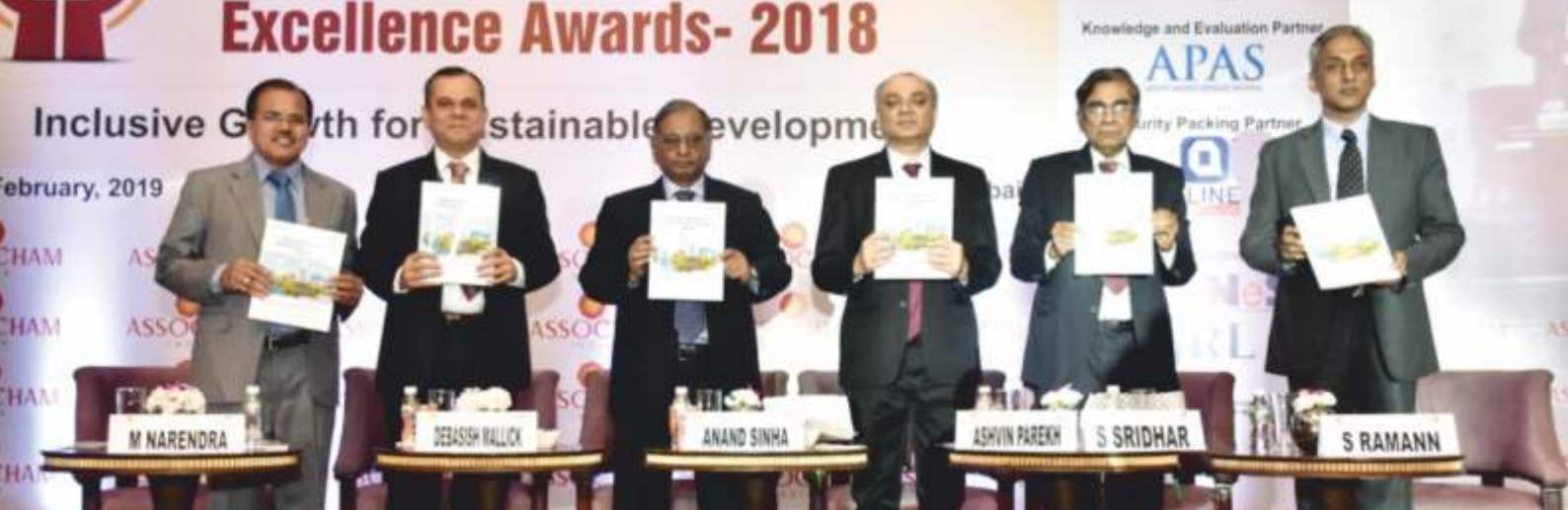
Release of Knowledge Report by Chief Guest at 14th Annual Banking Summit 2018 held on 26th February 2019, Mumbai.