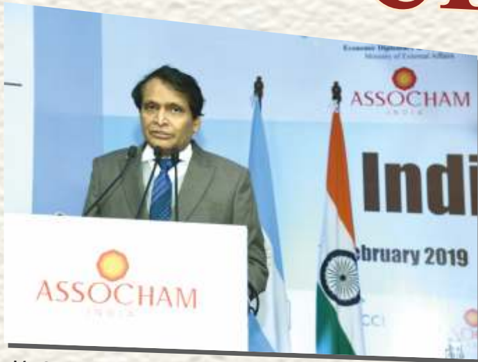
Mr Suresh Prabhu Minister of Commerce & Industry, and Civil Aviation Government of India addressing the gathering at the India-Argentina Business Forum in New Delhi