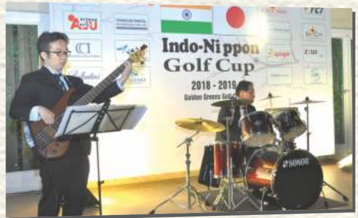
Performing a band during Indo-Nippon Golf Cup 2018-2019