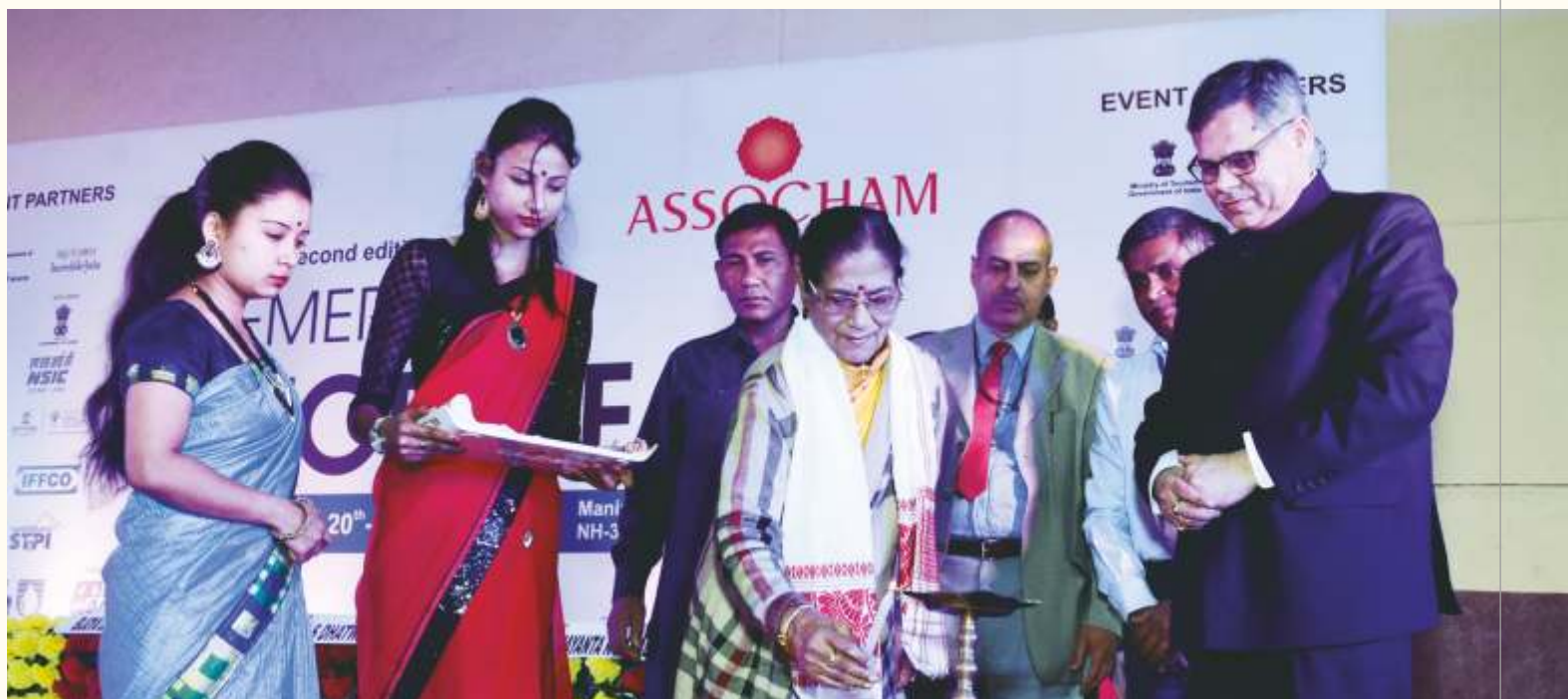
Smt Bijoya Chakravarty, Hon'ble Member of Parliament – Lok Sabha lightening lamp of 2nd Edition of Emerging North East 2019 held from 20-22 Feb, 2019 in Guwahati, Assam